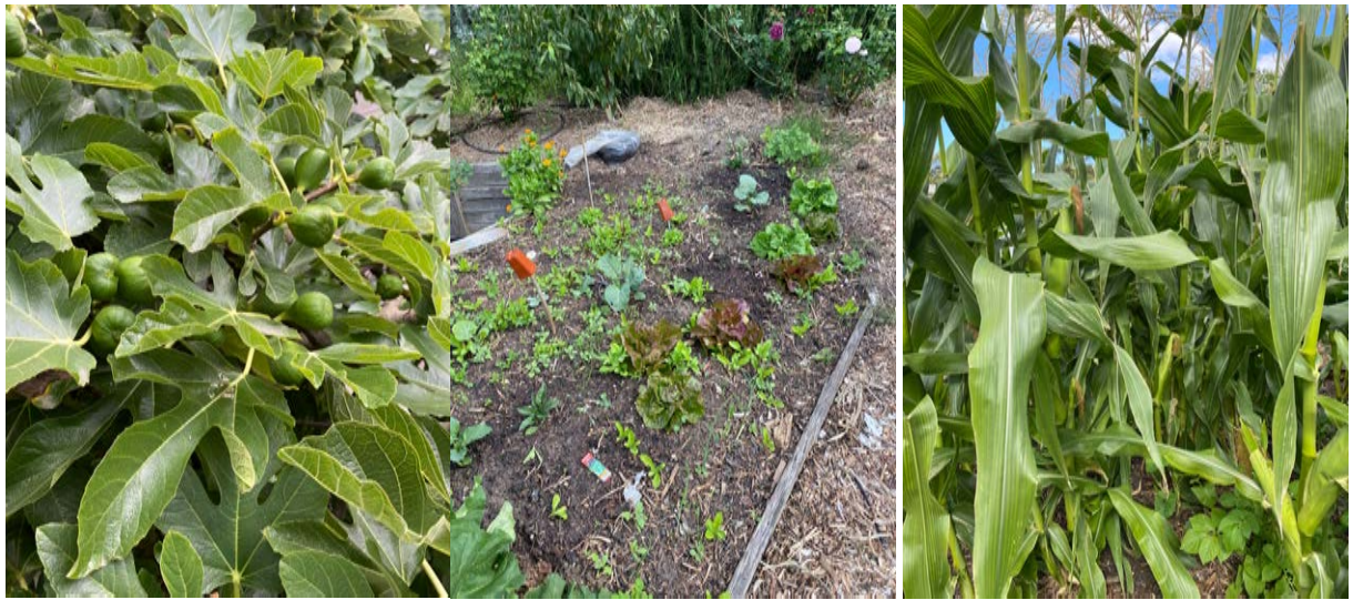
The figs are coming along. 'Kim's' garden bed is growing. The corn is ready to pick