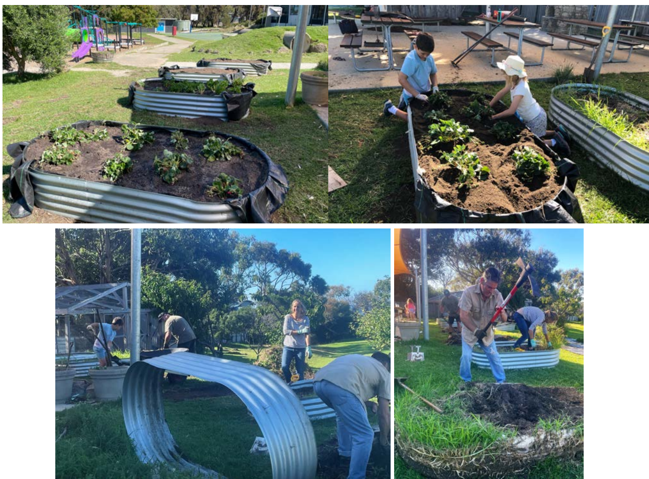
A productive working bee at the school