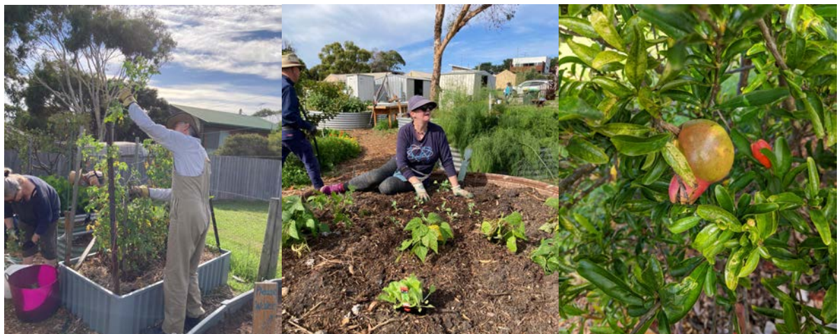
Working hard at our last working bee to prepare the garden for winter plantings. Our one and only pomegranate