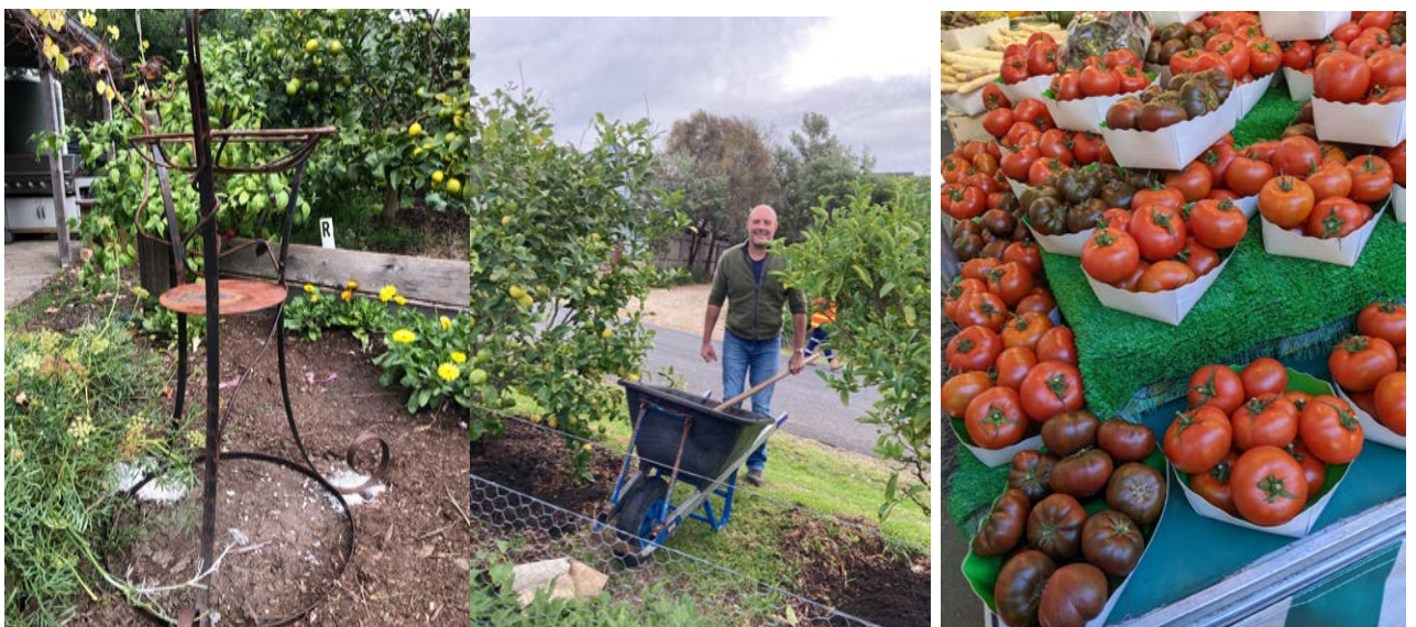
The birdbath in its new location. Scott came to the rescue with mulching the citrus verge with Gay. Tomato's from Gretel's travels in France – dreaming about our next crop.